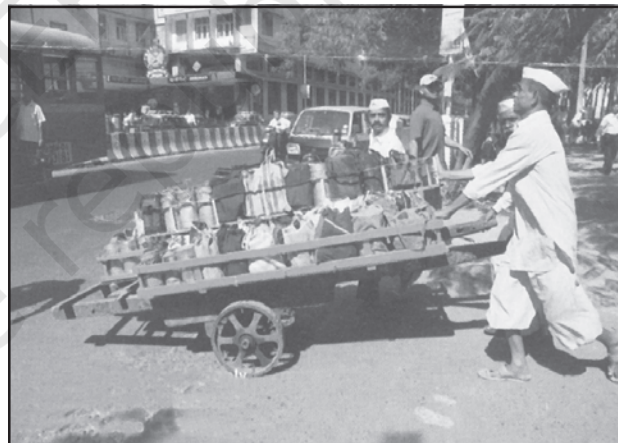
Fig. 7.4: Dabbawala Service in Mumbai

Personal services are made available to the people to facilitate their work in daily life. The workers migrate from rural areas in search of employment and are unskilled. They are employed in domestic services as housekeepers, cooks, and gardeners. This segment of workers is generally unorganised. One such example in India is Mumbai's dabbawala (Tiffin) service provided to about 1,75,000 customers all over the city.