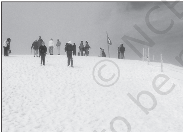
Fig. 7.5: Tourists skiing in the snow capped mountain slopes of Switzerland

Tourism is travel undertaken for purposes of recreation rather than business. It has become the world's single largest tertiary activity in total registered jobs (250 million) and total revenue (40 per cent of the total GDP). Besides, many local persons, are employed to provide services like accommodation, meals, transport, entertainment and special shops serving the tourists. Tourism fosters the growth of infrastructure industries, retail trading, and craft industries (souvenirs). In some regions, tourism is seasonal because the vacation period is dependent on favourable weather conditions, but many regions attract visitors all the year round.