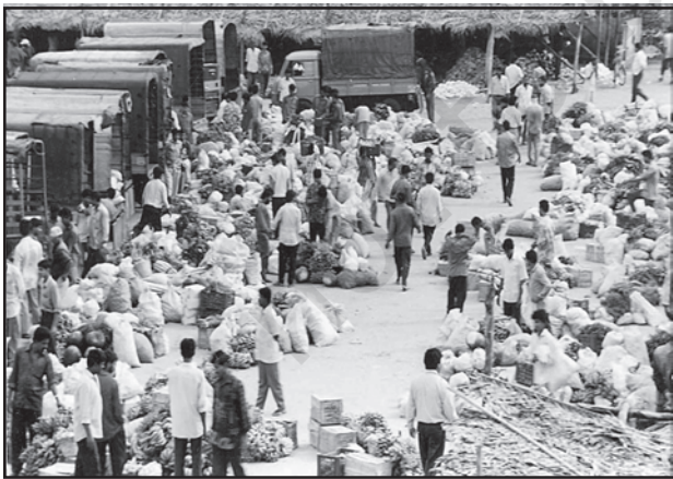
Fig. 7.2: A Wholesale Vegetable Market

Rural marketing centres cater to nearby settlements. These are quasi-urban centres. They serve as trading centres of the most rudimentary type. Here personal and professional services are not well-developed. These form local collecting and distributing centres. Most of these have mandis (wholesale markets) and also retailing areas. They are not urban centres per se but are significant centres for making available goods and services which are most frequently demanded by rural folk.