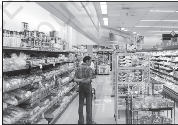
Fig. 7.3: Packed Food Market in U.S.A.

Urban marketing centres have more widely specialised urban services. They provide ordinary goods and services as well as many of the specialised goods and services required by people. Urban centres, therefore, offer manufactured goods as well as many specialised markets develop, e.g. markets for labour, housing, semi or finished products. Services of educational institutions and professionals such as teachers, lawyers, consultants, physicians, dentists and veterinary doctors are available.